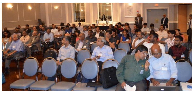
A Cross Section of the Audience at the Meeting