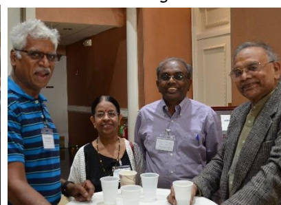
Some of the AANA Chicago Chapter's 2018 AANA National Meeting Organizing Committee Members