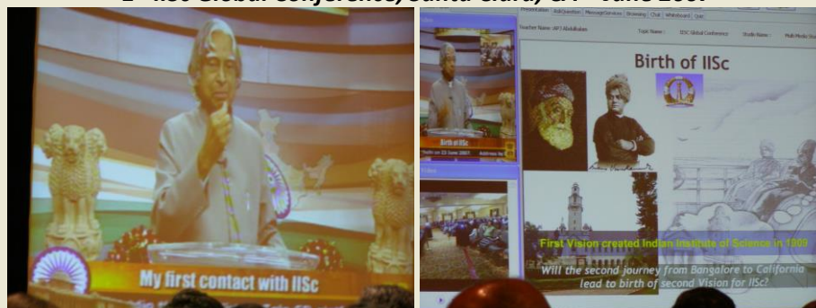
President Abdul Kalam addressing the attendees (via web)