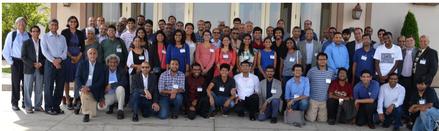
Attendees at the 2018 IISc AANA National Meeting, Chicago, August 26, 2018