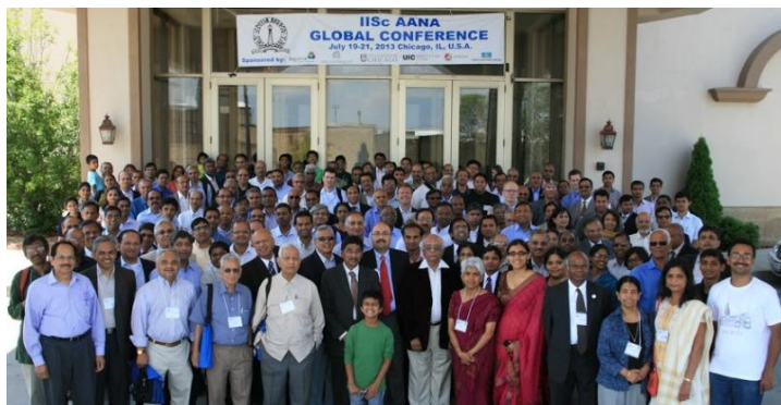
2 nd Global Conference, Chicago – August 2013 (Over 350 attendees)

The website for the conference including details on registration, accommodation and preliminary program, is up and running. Hotel rooms are blocked at a discount price. Please go ahead immediately and book your journey to what we promise will be a "Historic Reunion" - further details at: https://conf2019.iiscaana.org