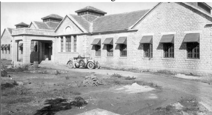
IISc Physics Department Building (1920's)