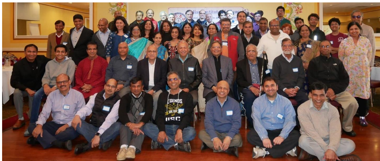
AANA members and family at the 2019 IISc Founder's Day Event

The main focus during the last one year has been on planning the upcoming 2019 IISc Global Conference on June 21-23 at the Crowne-Plaza Hotel in Palo Alto. A preliminary program has been put together and speakers are being confirmed and serious fund-raising efforts are underway.