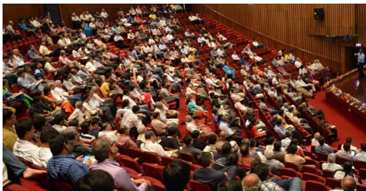
3 rd Global Conference, Bengaluru – 2015 (Over 1000 attendees)

Any tax-deductible donation/endowments can be made to IISc AANA or through IISc AANA to IISc, including student support. IISc AANA is a California registered 501(c) (3) non-profit organization, Tax ID: 03-0602301