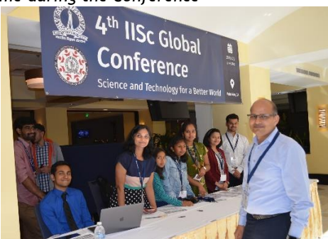
Volunteers at the Registration Desk

Any tax-deductible donation/endowments can be made to IISc AANA or through IISc AANA to IISc, including student support. IISc AANA is a California registered 501(c) (3) non-profit organization, Tax ID: 03-0602301