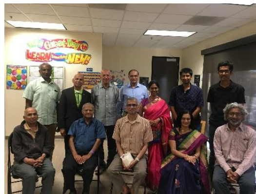
IISc AANA Members (San Diego), April 2019