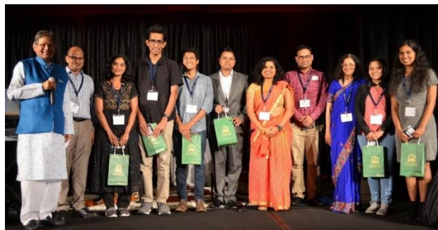
Members of the Organizing Committee