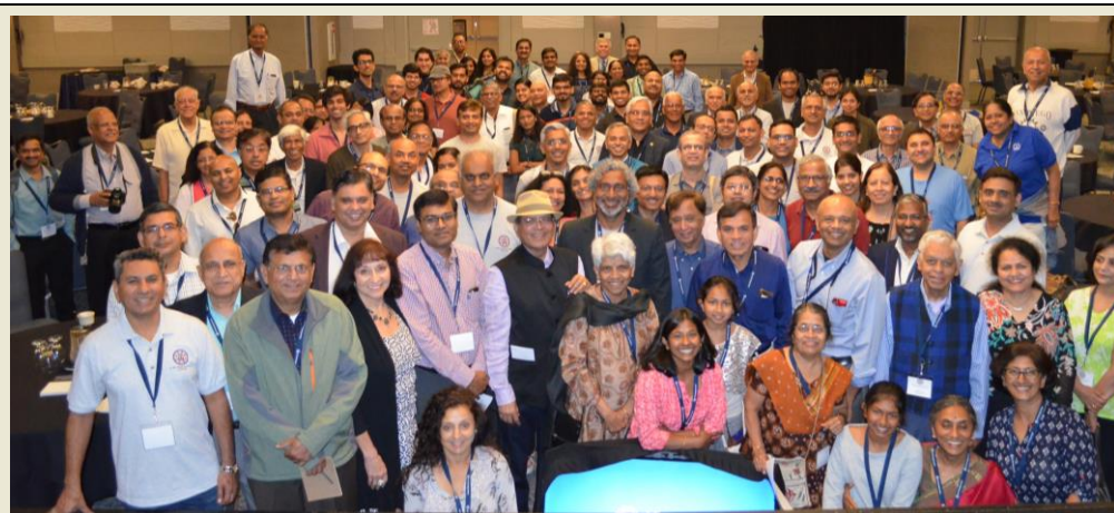
Some of the attendees at the 4 th IISc Global Conference at Palo Alto, CA