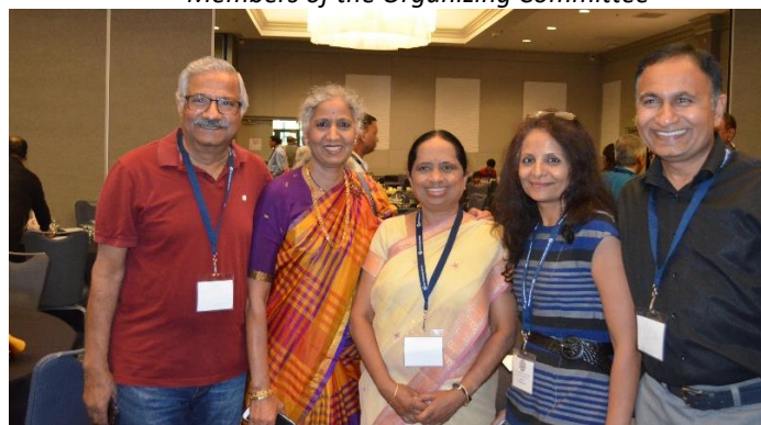
Silicon Valley Members of the Organizing Committee