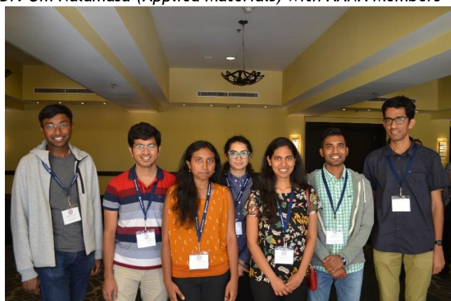
IISc UG Alumni Students of the Organizing Committee