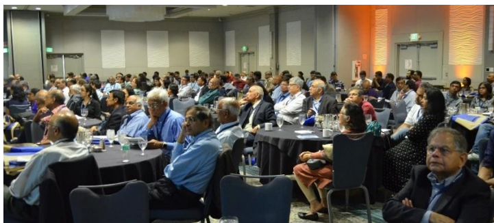
Attendees at the 4 th IISc Global Conference