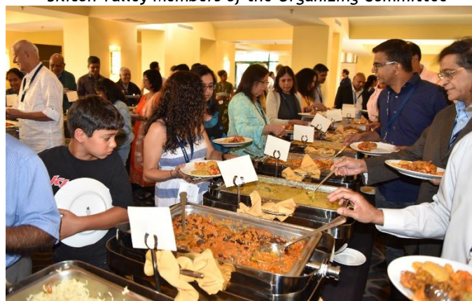
Lunch Time during the Conference