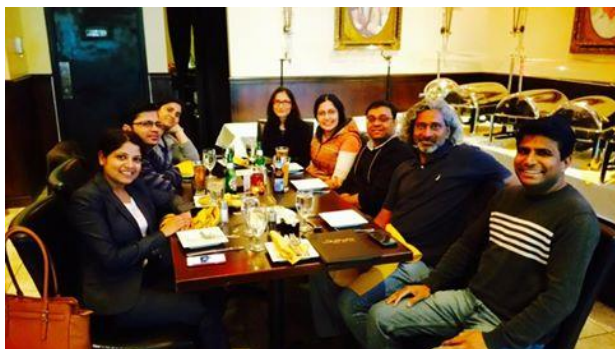
A Dinner Dialog with DC IISc Alumni/Alumnae on May 17, 2016